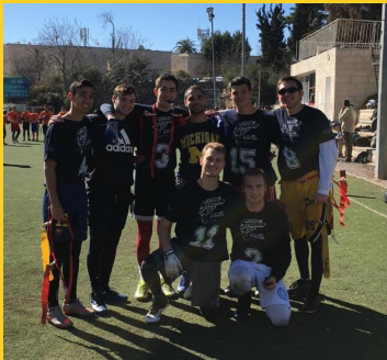
Our alumni are enjoying playing on the TABC sponsored flag football team in Israel.